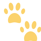
animal tracks or hole